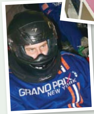
Grand Prix New York, Mount Kisco

The region's premiere amusement park and entertainment center, featuring 50 rides for children and adults, including roller coasters, vertical thrills, water rides and Kiddyland. Playland has a beach, boardwalk and pier on beautiful Long Island Sound; a swimming pool, lake boating, picnic area, free entertainment and fireworks; mini golf, catered outing facilities and indoor ice skating. Playland was America's first totally planned amusement park, featuring Art Deco structures. Dedicated