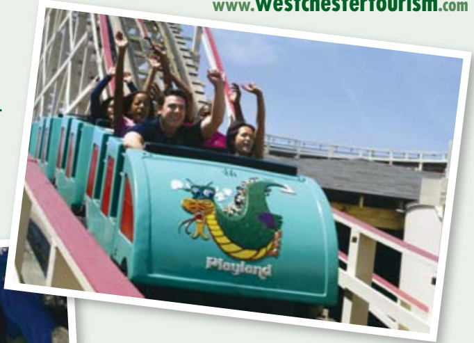
Playland Amusement Park, Rye

as a National Historic Landmark in 1987, Rye Playland has provided family fun since 1928.