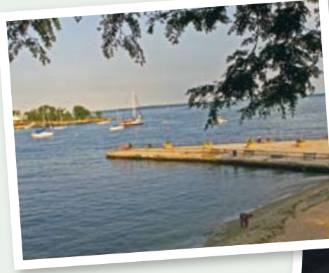
(Top) Hudson Park with Long Island Sound View (Right) Untermyer Park Gardens, Yonkers

Sprain Lake Golf Course Grassy Sprain Road, Yonkers, 231-3481 Eighteen holes, par 70, 6,026 yards. Pro shop, snack bar, restaurant.